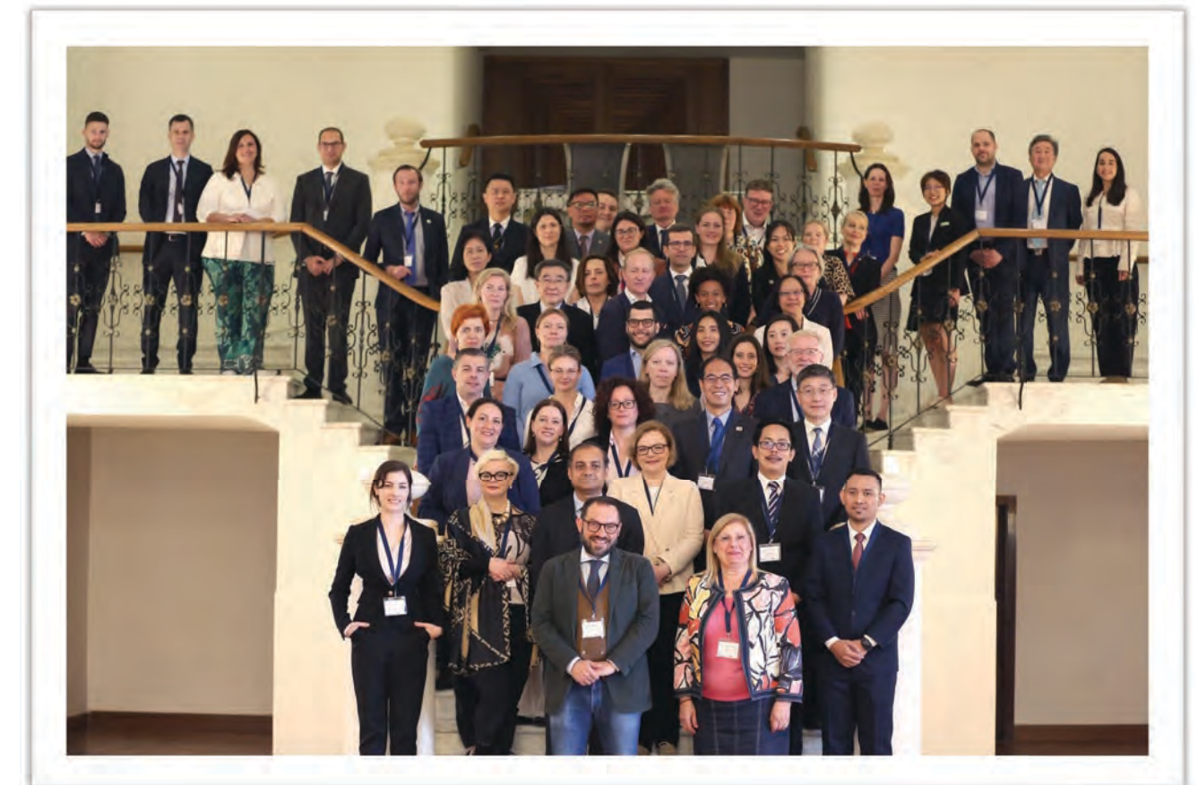
Senior Officials' Meeting 1 (SOM1), 22-23 May 2023, Malta