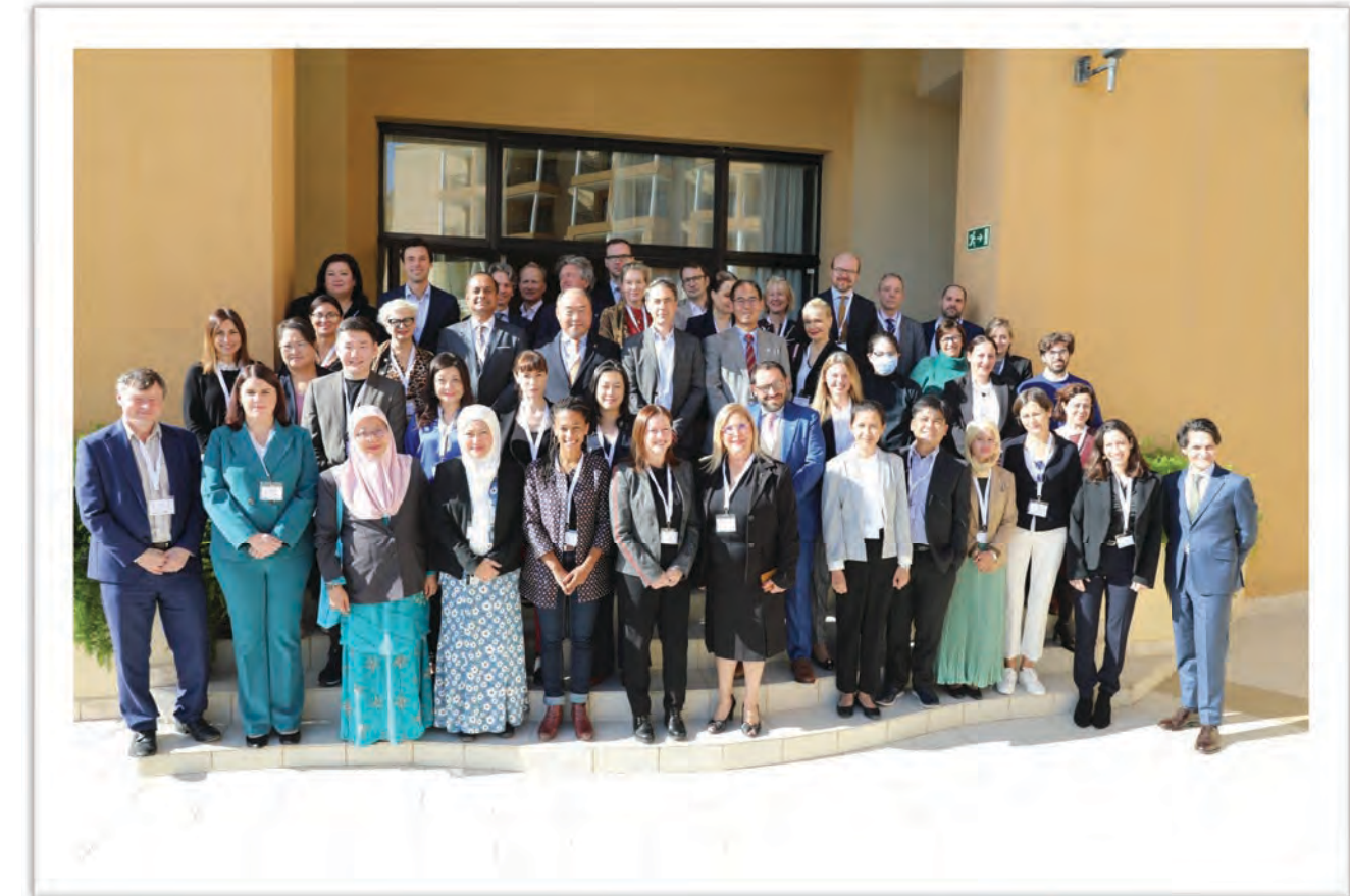
Intermediate Senior Officials' Meeting (ISOM), 24-25 November 2022, Malta