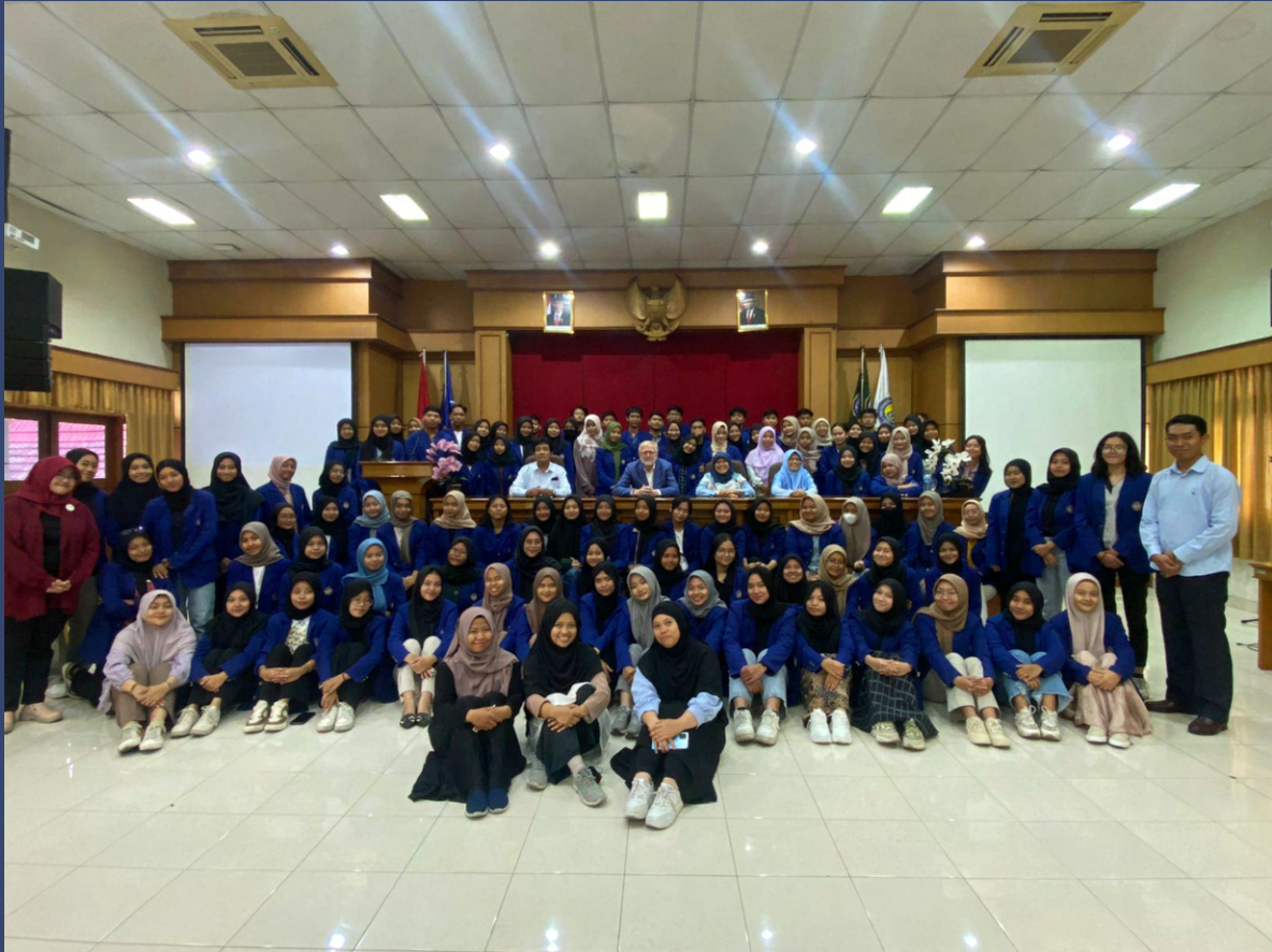
Chair's visit to the Faculty of Education, Universitas Negeri Yogyakarta, Indonesia

The Laurels, Western Road, University College Cork, Cork, Ireland