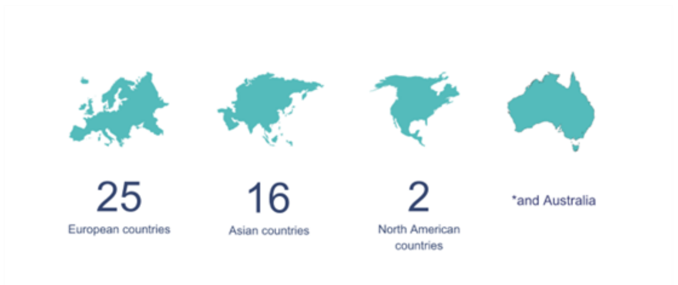
Fig. 2 The Total Number of Countries by Region Across all Seven Research Networks 1