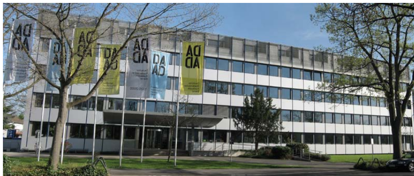
DAAD Deutscher Akademischer Austausch Dienst German Academic Exchange Service