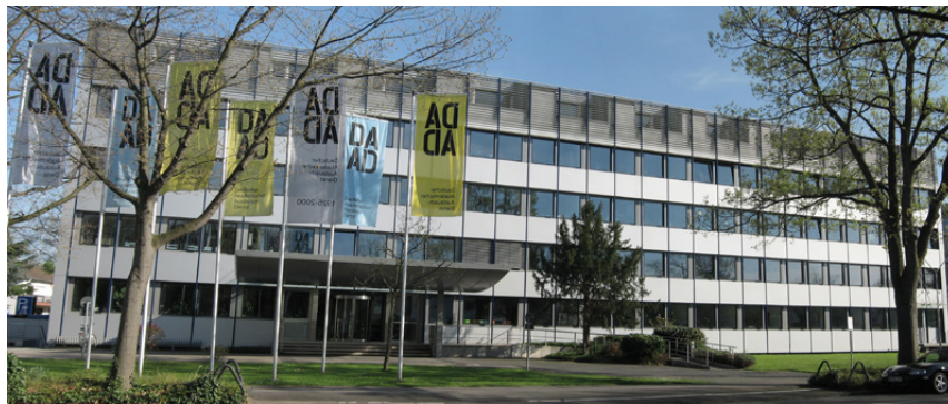
DAAD Deutscher Akademischer Austausch Dienst German Academic Exchange Service