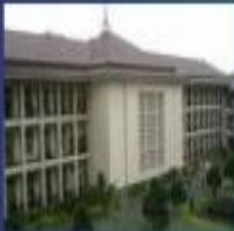
Universitas Gadjah Mada