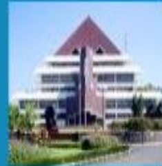
Institut Pertanian Bogor