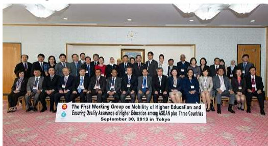
First Working Group (Tokyo, Sept. 2013)