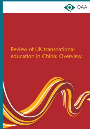
Country overview report