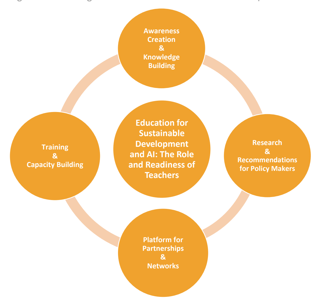
Figure: Theme and Framework for the 15th ASEF ClassNet Conference